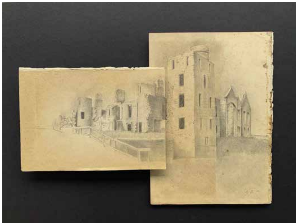
Lisa Gingers 'Ruins (Slaines Castle)' Pencil on found paper 49x34.5cm £375