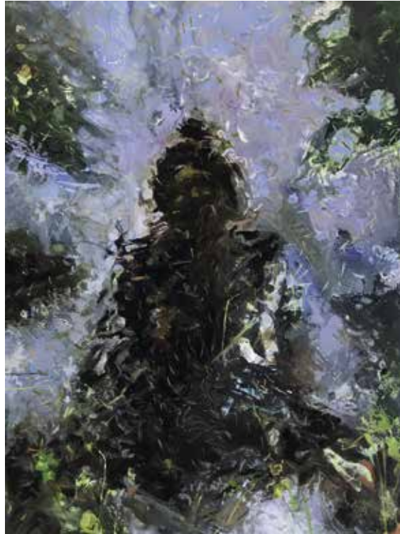
Michelle Boyle 'Forest, puddle, walk' Oil on panel 80x60cm £2,900