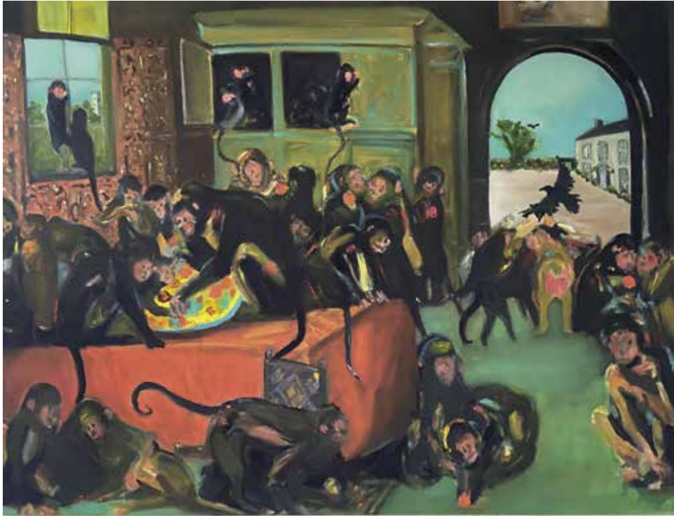
Serena Caulfield 'An Allegory Of Vanity' Oil on canvas 60x80cm £4,250