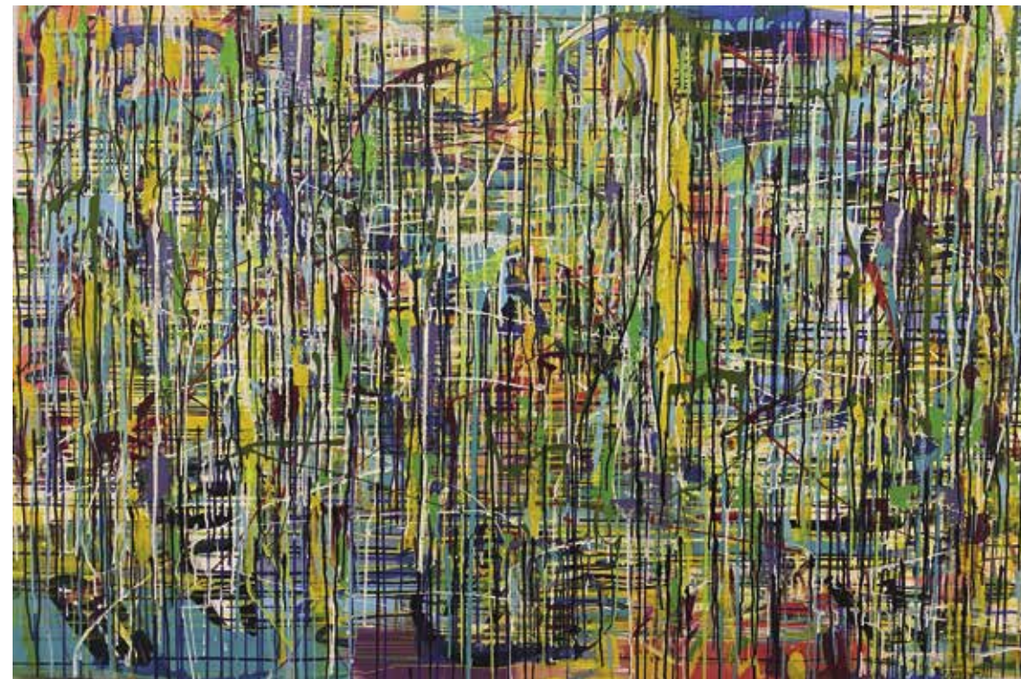
Adrienne M Finnerty 'Music In My Soul' Acrylic on canvas 122 x 184cm £2,700