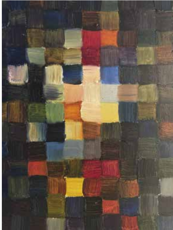
Paul Murray 'Drawn from borders' Oil on birch 15x10cm £175