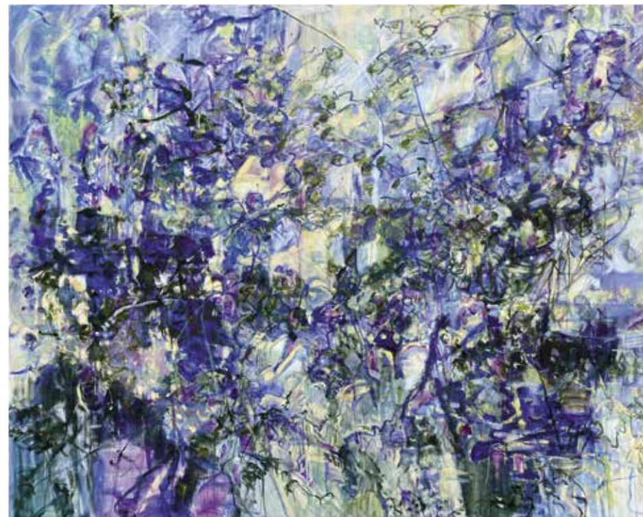
Ciara Gormley 'Blue is The Night Garden' Oil on canvas 152x122cm £2,950