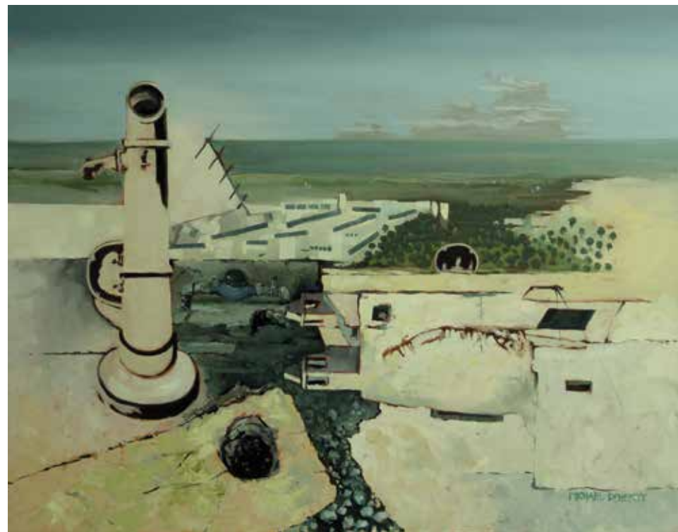
Michael Doherty 'Blue Valve' Oil on canvas 102.5x82.5cm £1,950