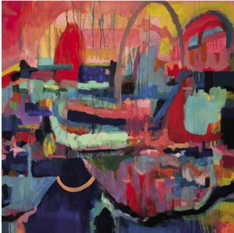
Michelle Harton 'Holiday Dreaming' Acrylic, gouache, embroidery on canvas 80x80cm £1,800