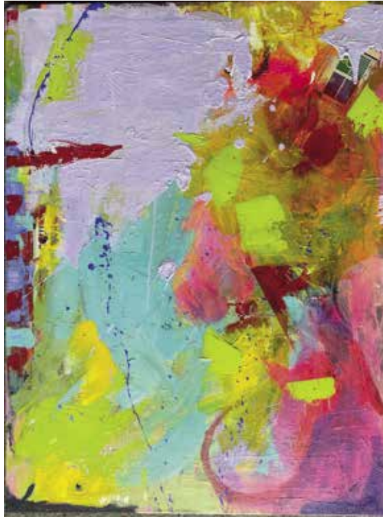
Siobhan Cox Carlos 'Allons-y' Mixed media on canvas 108x85cm £1,500