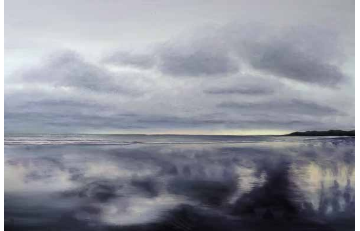
Orlagh Meehan Gallagher 'Born Across Waves, Evaporating' Acrylic on canvas 80x120cm £1,750