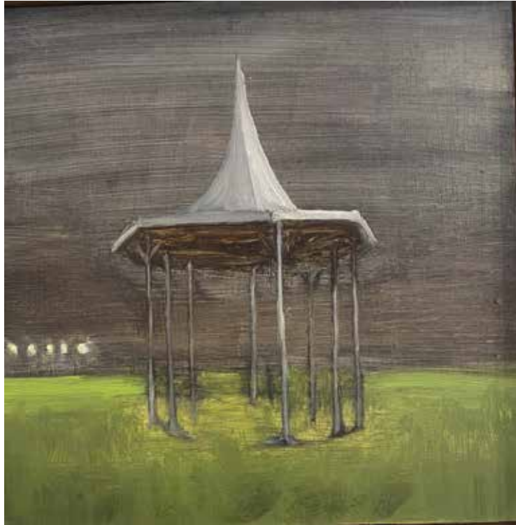
Raphael Llewelyn 'The Park' Oil on birch 20x20cm £275