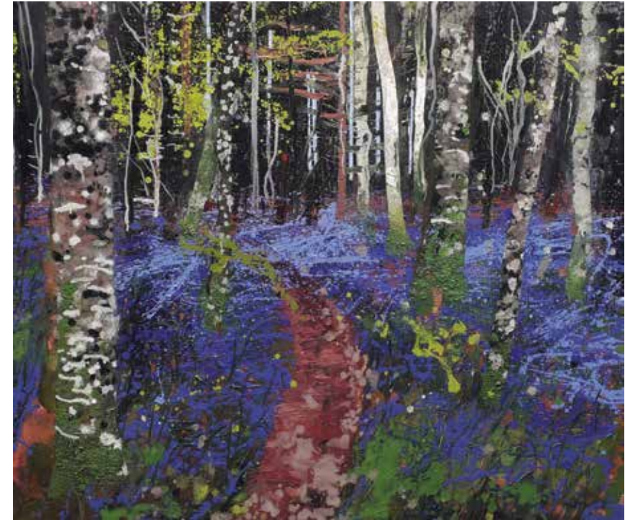
Neal Gregg 'Spring Wood' Oil on canvas 195x100cm £4,000