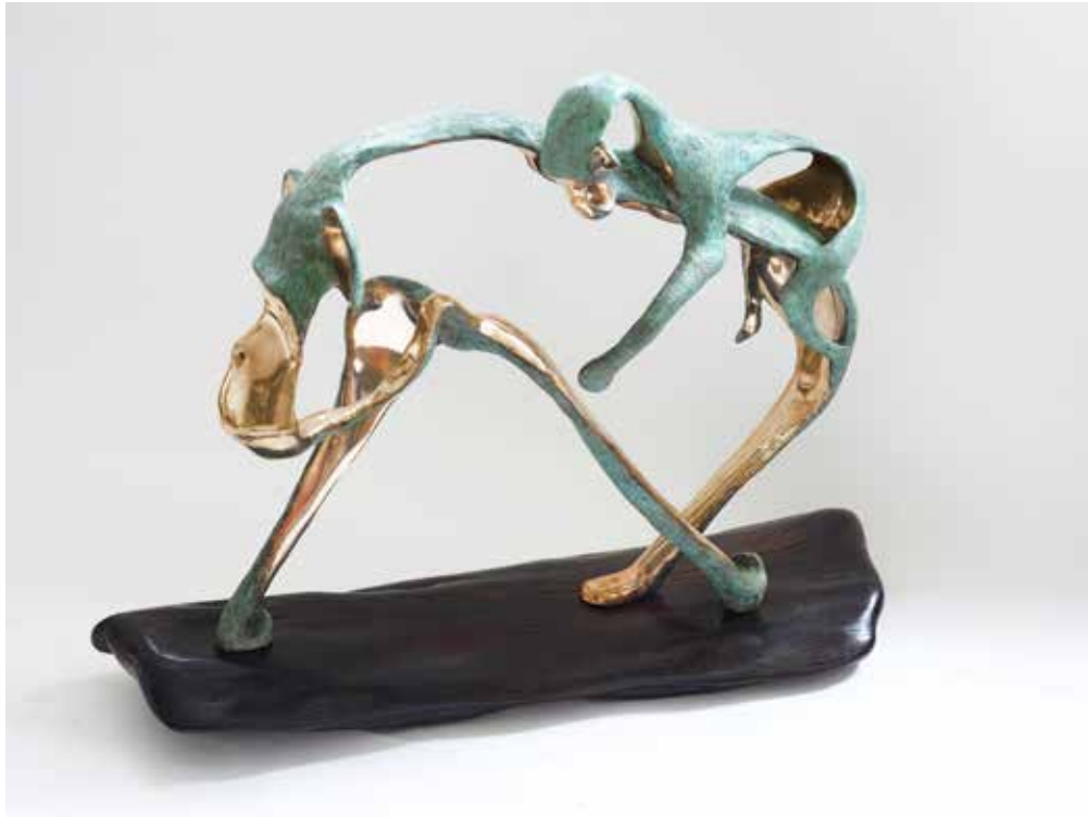
Ani Mollereau Chimp Bronze sculpture on bog oak 64x54cm £7,250