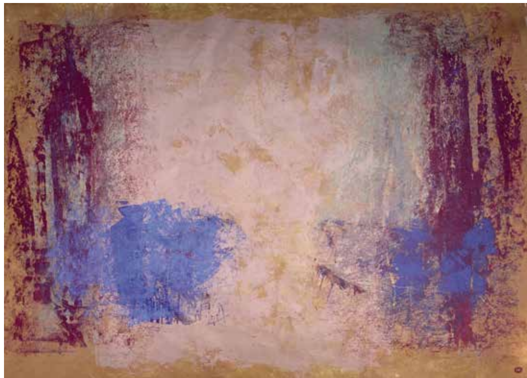
Liz Doyle 'Fermanagh Days' Mixed media on canvas 130x190cm £3,500