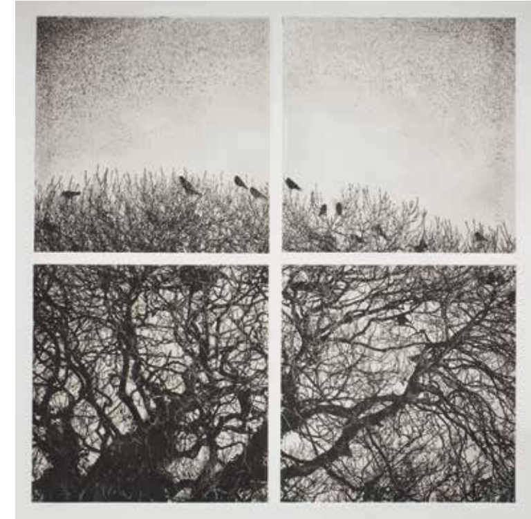
Matthew Gammon 'Easkey Roosting' Hand pulled polymer photogravure 72.5x78cm £565