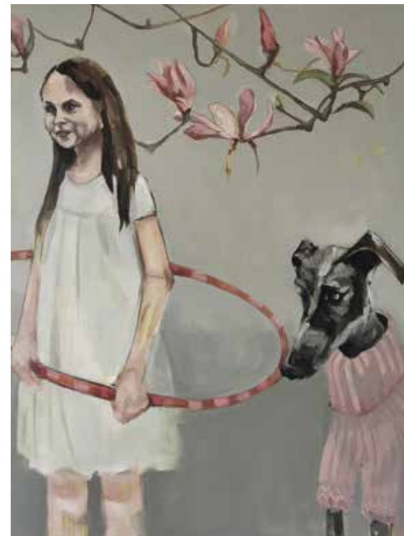
Bernadette Doolan 'Loyal Friend' Oil on canvas 106x126cm £5,400