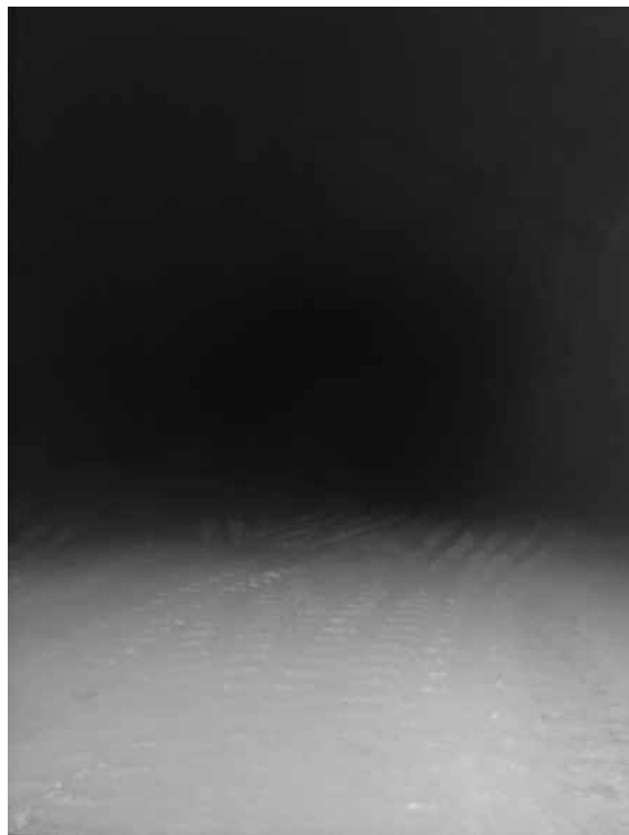
Euan Gébler 'Non-Time. Non-Place' Digital photograph 47.5x61.5cm £195