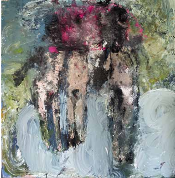
Katarzyna Gajewska 'Summer in Kerry' Mixed media on canvas 150x150cm £6,750