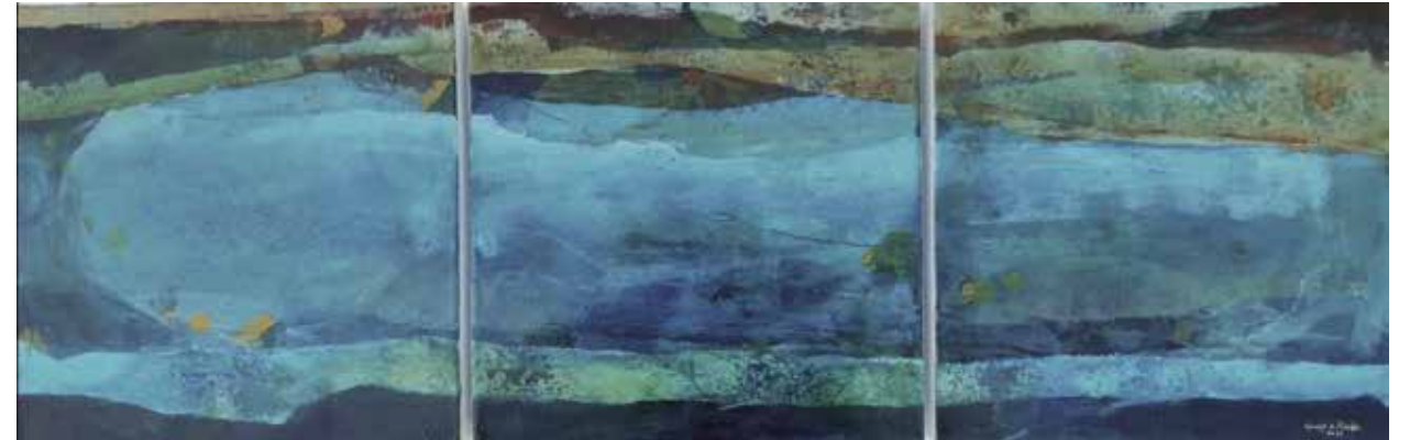
Geoff O'Keefe 'Rock Shallows' Acrylic on canvas 39x91cm £995