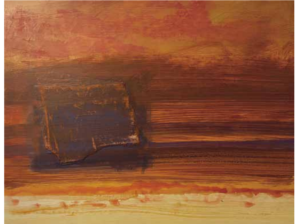
Bridget Flannery 'Source - Bog pool Abbeyleix 2021' Acrylic, collage on birch 41x51cm £1,670