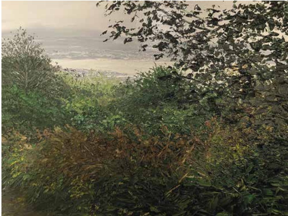
Stephanie Noble 'Hold Your Ground' Oil on canvas 60x60cm £1,750