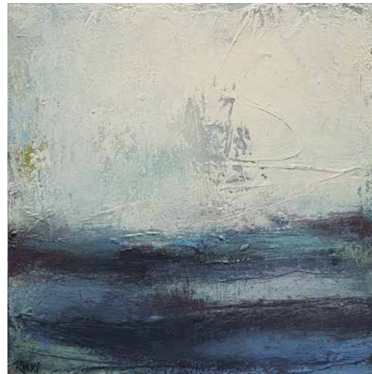
Rikki van den Berg 'Waiting on tide's return' Acrylic on birch 19x19cm £395