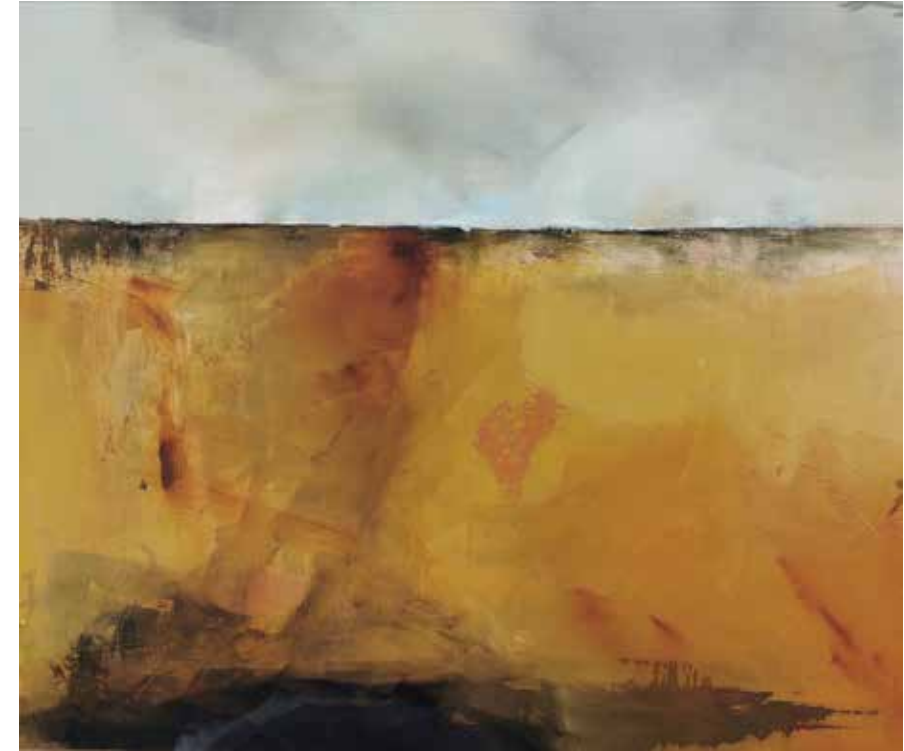
Peadar McDaid 'Lochán Dubh (Black Pond)' Oil on panel 50 x 60cm £795