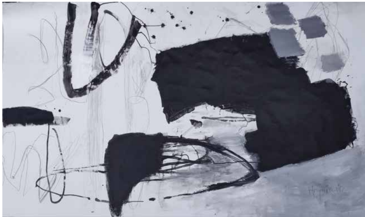
Anna Hryniewicz 'Hold on to your dreams' Acrylic on canvas 114x203cm £3,200