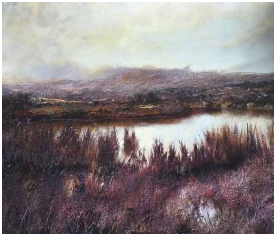
Lorna Smyth 'As darkness encroaches all around' Acrylic & needlework on canvas 51x61cm £1,250