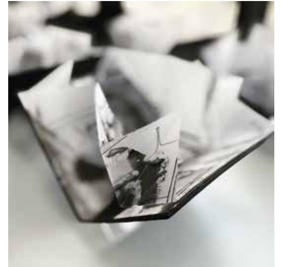
Karen Daye Hutchinson 'Fanacht' Map: Pigment Ink Drawing with Touché, Linen Stitch - Truegrain, Fabriano 84x113cm Book: Pigment Ink, Touché, Monoprint, Linen Stitch - Truegrain, Book Cloth 20x27cm £1,600