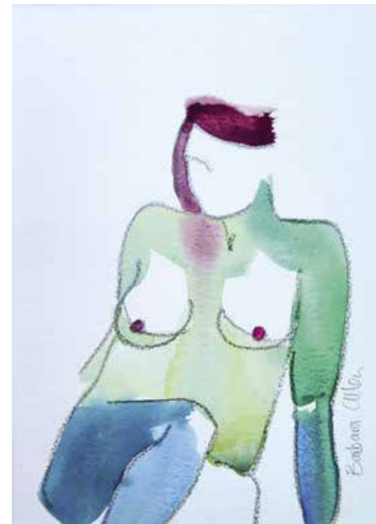
Barbara Allen RUA 'French Nude' Watercolour & graphite 60x47cm £925