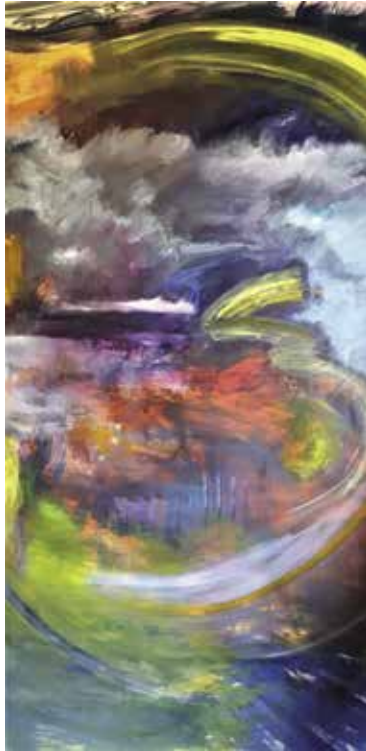
Sinead Smyth 'The sea was soft and full of secrets' Mixed media on Fabriano 184x150cm £1,950