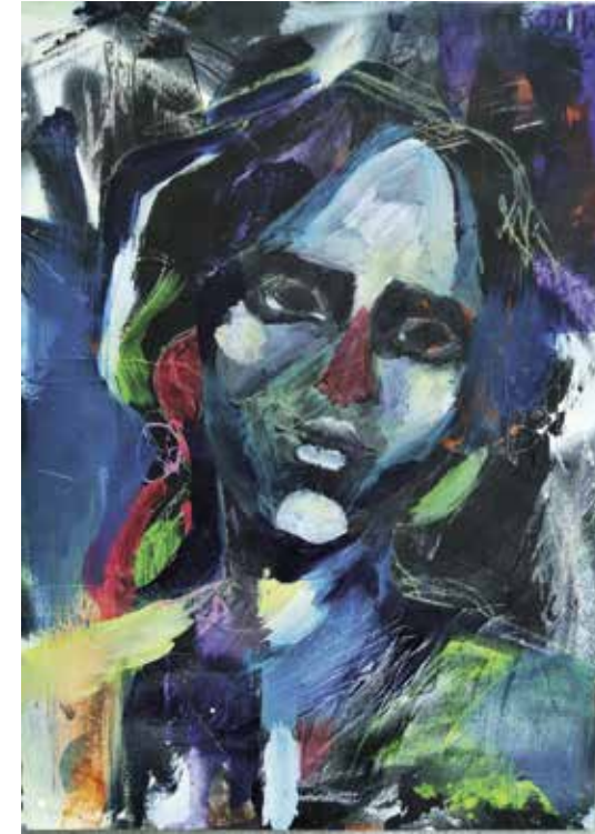
Kirsi Salo 'Louise' Mixed media on canvas 77x61cm £990