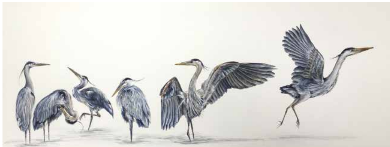
Kate Plum 'Stay Alive' Acrylic on canvas 33x80cm £950